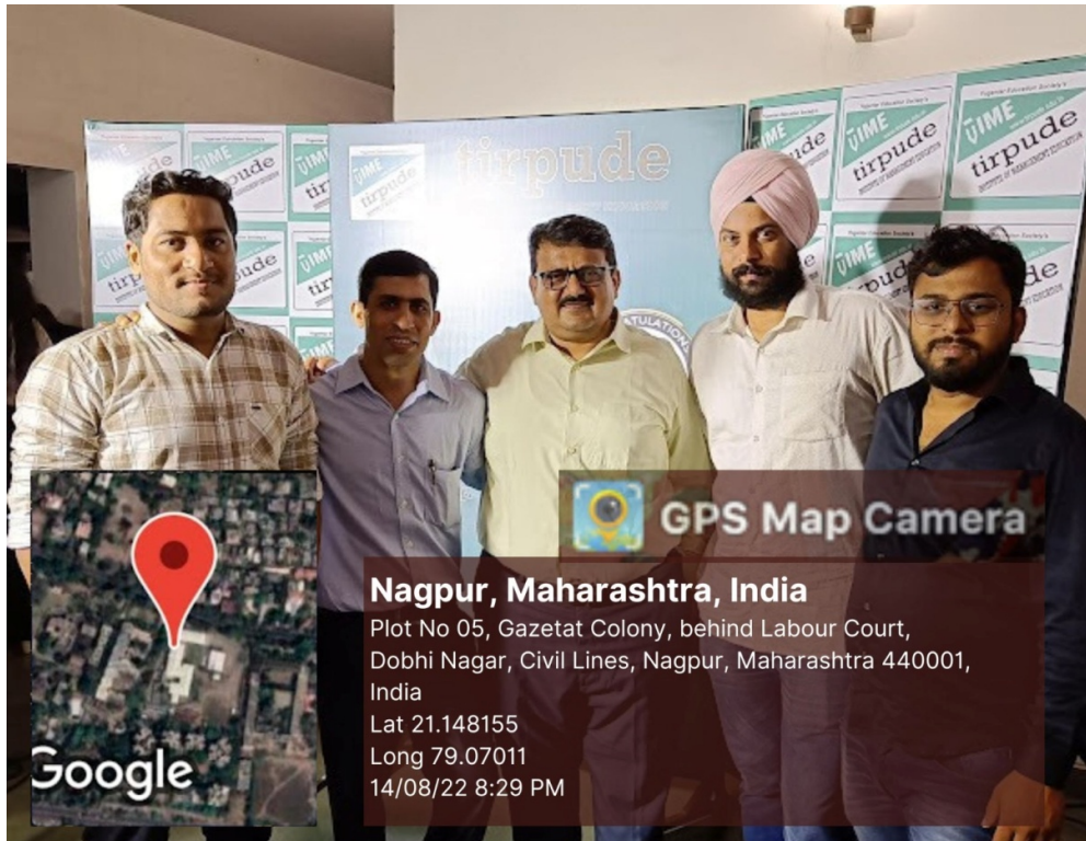
Alumni Meet 2022 at Chitnavis Centre , Civil Lines, Nagpur