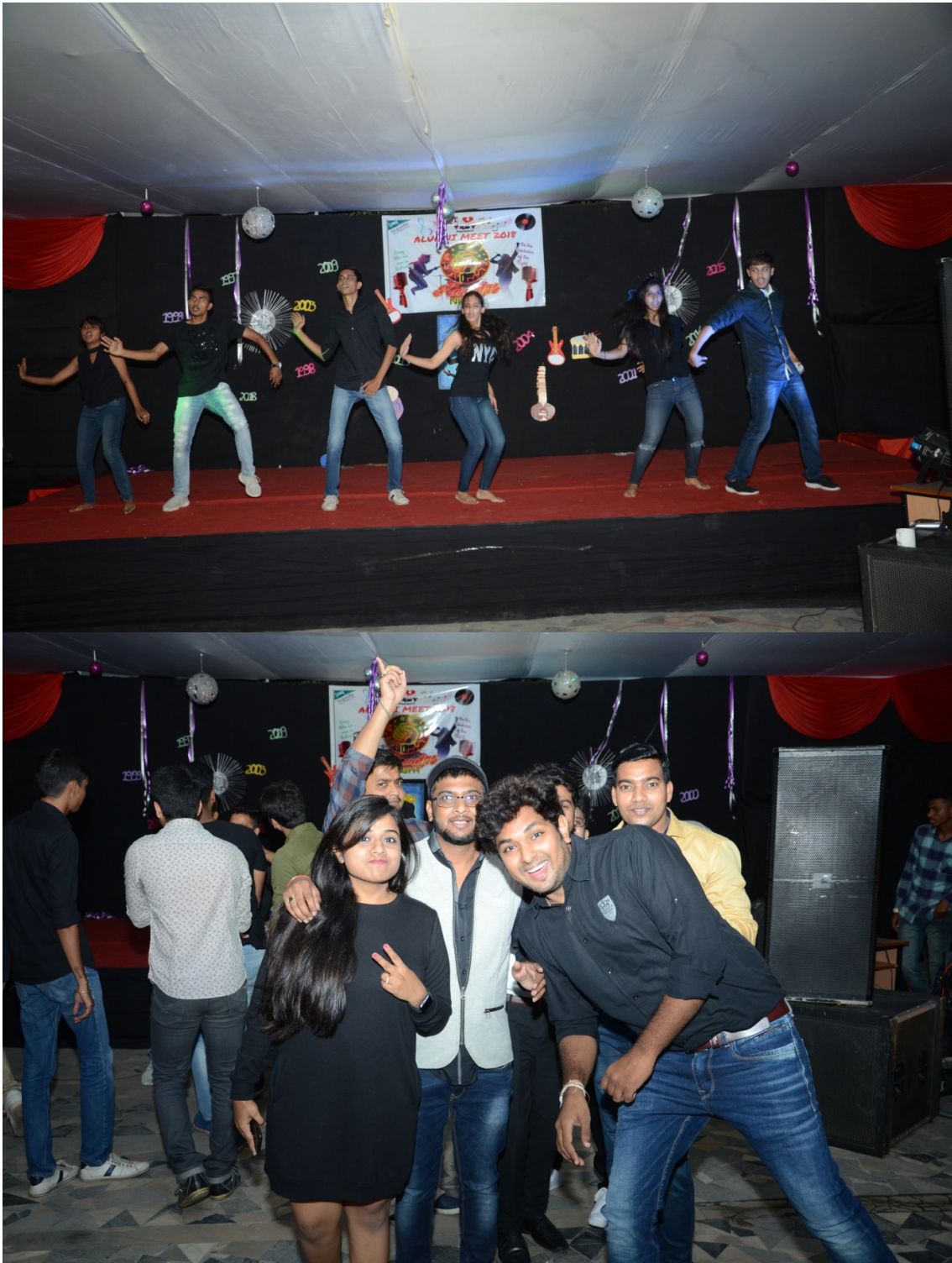
Alumni Meet 2018