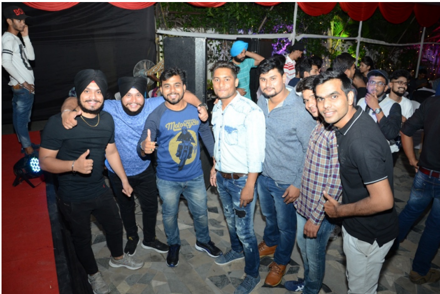
Alumni Meet 2019