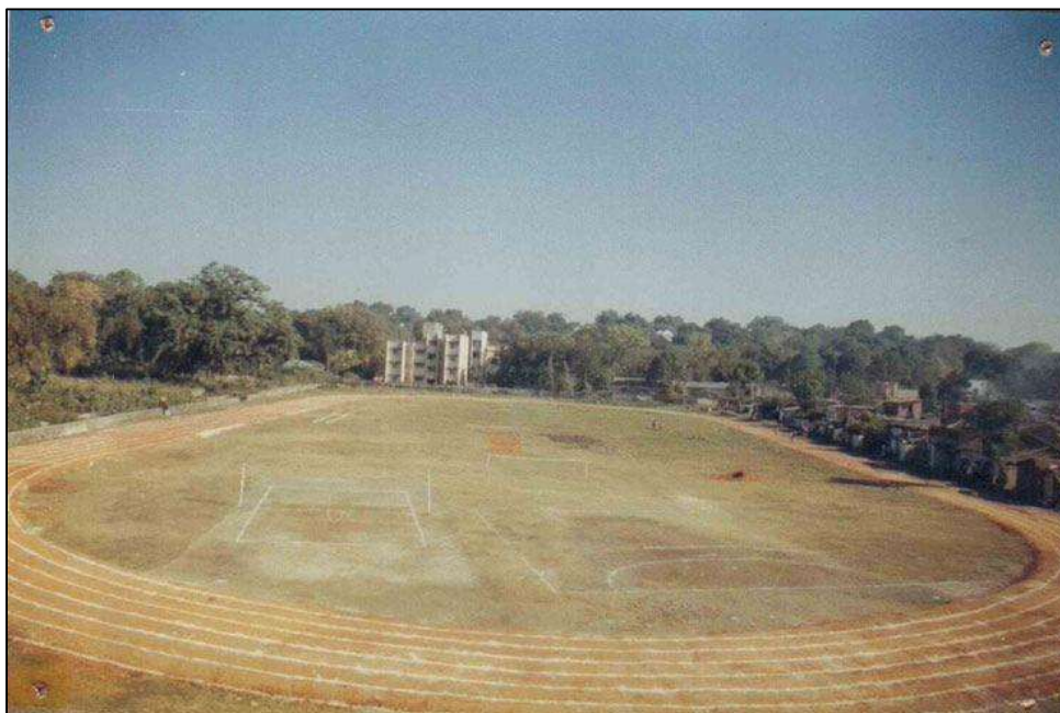
Photograph of Outdoor facilities

Outdoor Sports facilities include Football ground