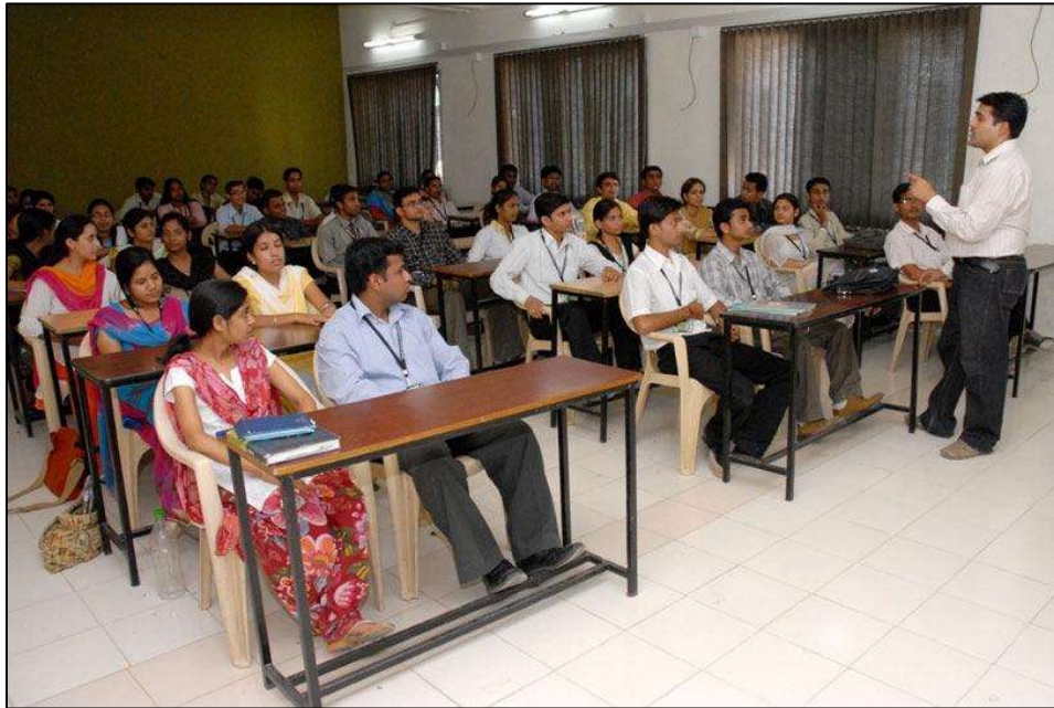
Photograph of Tutorial room

Total No. of Tutorial Rooms – 05, Avg. Carpet Area – 48 sq.mtr