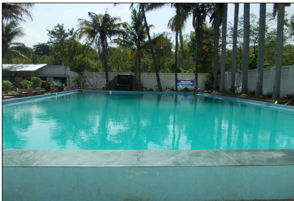
Photograph of Swimming Pool