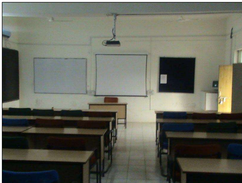
Photograph of Classroom

Classroom/Tutorial Room facilities: Total No. of Classrooms – 09, Avg. Carpet Area – 90 sq.mtr.