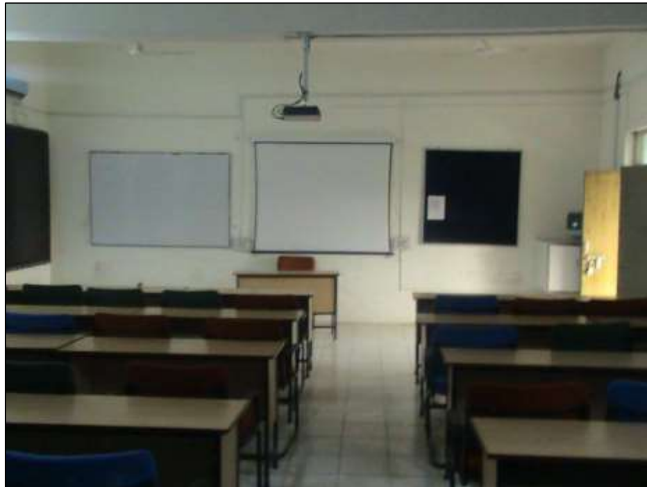
Photograph of Classroom

Classroom/Tutorial Room facilities: Total No. of Classrooms – 09, Avg. Carpet Area – 90 sq.mtr.