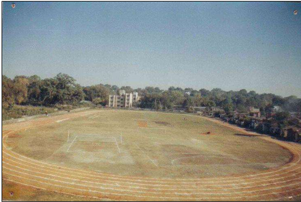
Photograph of Outdoor facilities

Outdoor Sports facilities include Football ground