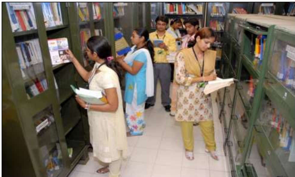
Photograph of library