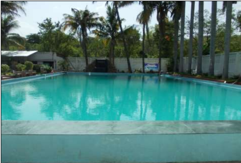
Photograph of Swimming Pool