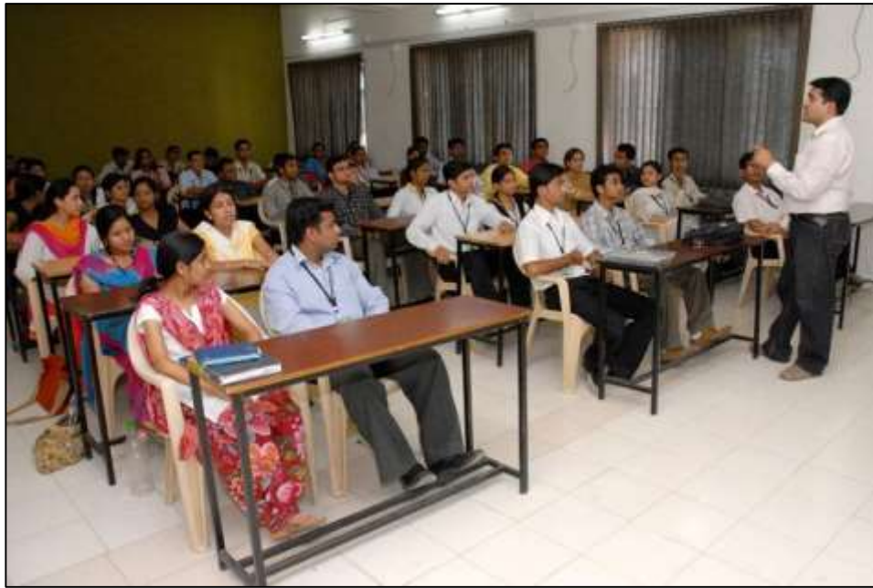
Photograph of Tutorial room

Total No. of Tutorial Rooms – 05, Avg. Carpet Area – 48 sq.mtr